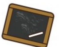
chalk & slate

Victorian schools were different from schools today. Victorian schools were very strict and had lots of rules. Students had to stand up every time an adult entered the room and they had to write with their right hand, even if they were left-handed! Punishment was very harsh and a child would get the cane for bad behavior or be made to stand in the corner for mistakes in class.