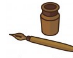
dip pen & ink